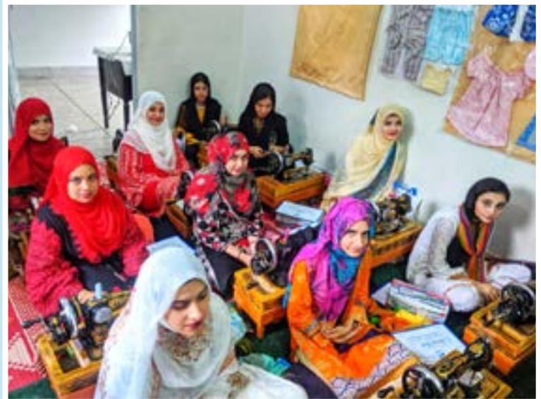
Vocational Centres for girls. Bottom pic: A baby dress sewn by trainees.

Their marketable skills will help the girls come out of their unproductive state to become partners in economic growth and make them self-reliant.