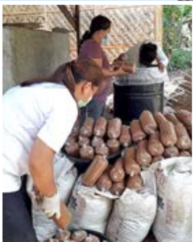
~ Beneficiaries ~ Barangay Samal