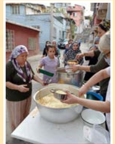
Food for needy families in Agora

She is a member of IWC İzmir working in many positions of the executive of the club as well as in District 244.