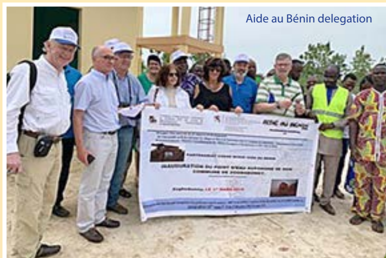
Aide au Bénin delegation

This is why I dedicate the Margarette Golding Award to all women in Benin—these brave women who fight every day to provide for the needs of their families.