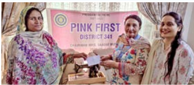
Sewing machines presented by IWC Sahiwal Central

The IWC Lahore Sharqi Vocational Centre plays a part in a MOTHER AND CHILD HEALTHCARE (MCH) Centre which gives totally free of cost baby delivery and welfare services to underprivileged women. The trainees at the vocational centre are taught and required to stitch and prepare for each newborn — a hamper comprising of cloth handbag, one wraparound sheet, one frock, a pair of socks, head cover and a sweater (for winter days). Materials are provided by Rotarians and Inner Wheel members of Lahore Sharqi. This hamper is purchased by MCH and given as a gift to the needy mothers as an initial support. The money then goes to the trainee girls as their well earned income.