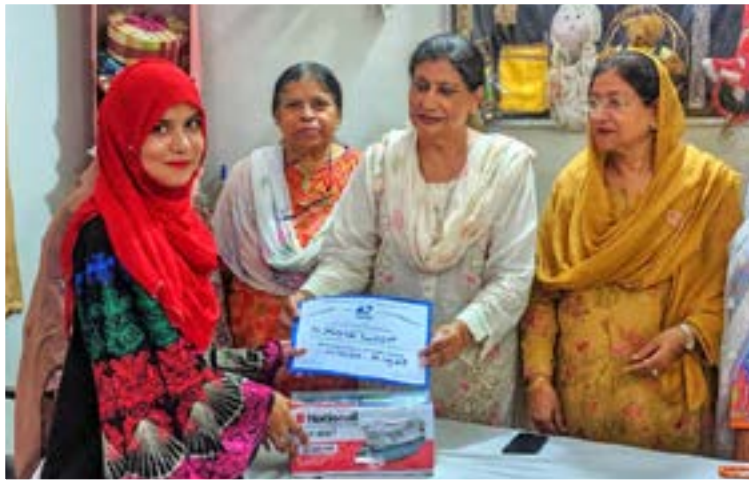
Distribution of Certificates and clothes irons to trainees by IWC Lahore Sharqi

The IWC Lahore Sharqi Vocational Centre plays a part in a MOTHER AND CHILD HEALTHCARE (MCH) Centre which gives totally free of cost baby delivery and welfare services to underprivileged women. The trainees at the vocational centre are taught and required to stitch and prepare for each newborn — a hamper comprising of cloth handbag, one wraparound sheet, one frock, a pair of socks, head cover and a sweater (for winter days). Materials are provided by Rotarians and Inner Wheel members of Lahore Sharqi. This hamper is purchased by MCH and given as a gift to the needy mothers as an initial support. The money then goes to the trainee girls as their well earned income.