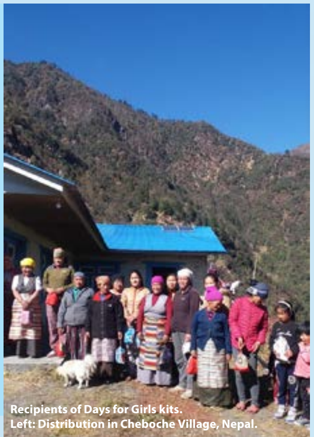
Recipients of Days for Girls kits. Left: Distribution in Cheboche Village, Nepal.